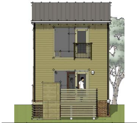
2 REAR ELEVATION 1/4" = 1'-0"